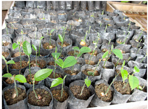
Rainforest seedlings await planting at Project ASRI, one of HiH's projects.